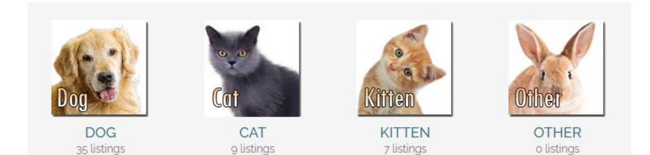
Select the type of pet you are interested in.